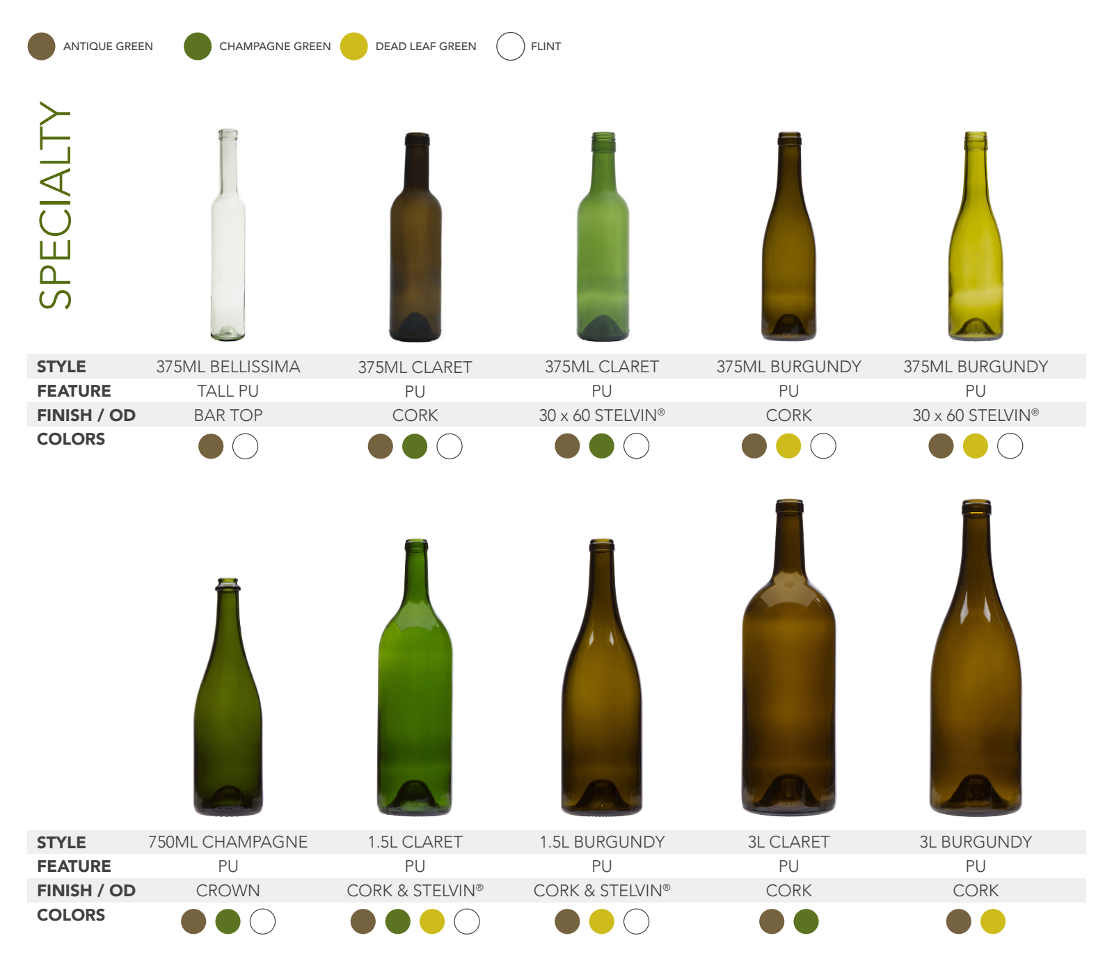
5L, 6L, 9L, 12L, 15L and 18L bottles are also available.